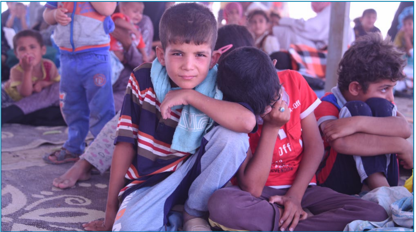
Above: Children, women and the elderly make up most of the population in the displacement camps in Ameriyat al Fallujah.