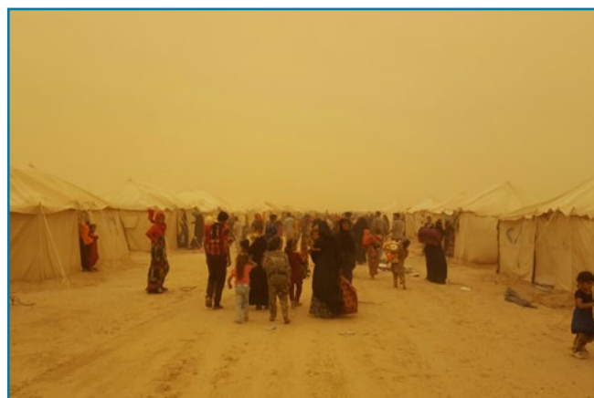
Above: Newly displaced families from Fallujah arrive in camps in Ameriyat al Fallujah.

In the wake of Fallujah, the humanitarian community has faced challenges in meeting the needs of the large influx of IDPs, due in part to bureaucratic barriers and a lack of sufficient preparedness. In order to gain access to Anbar aid agencies must complete a number of procedures, beginning with registration in Baghdad, followed by securing a letter from the Baghdad National Operations Centre in order to operate in Anbar. They must then obtain a facilitation letter for each individual needing to cross the Bzebiz Bridge into Anbar governorate. While the need for a system of registration is clear, the current procedures are time consuming and impact on the ability to respond quickly.