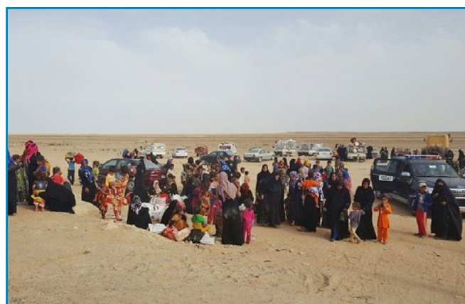
Above: Newly displaced families arriving in Kilo 18 camp.

Second, civilians have not been able to access genuinely safe routes away from conflict and violence. Those who do manage to escape often encounter further threats to their lives on their way to relative safety as routes are contaminated with unexploded ordnance and are sometimes patrolled by ISIS or other armed groups. Even once civilians do manage to escape these dangers, they face subsequent impediments to their