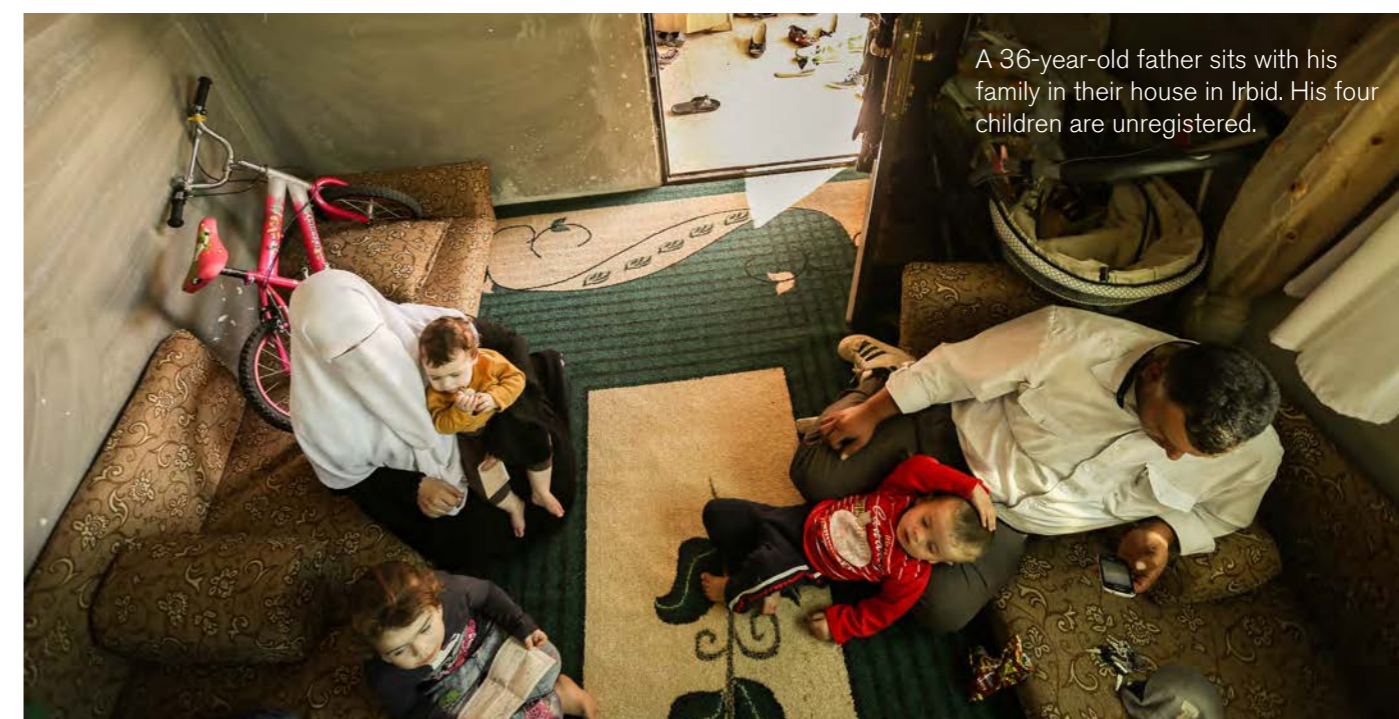
A 36-year-old father sits with his family in their house in Irbid. His four children are unregistered.