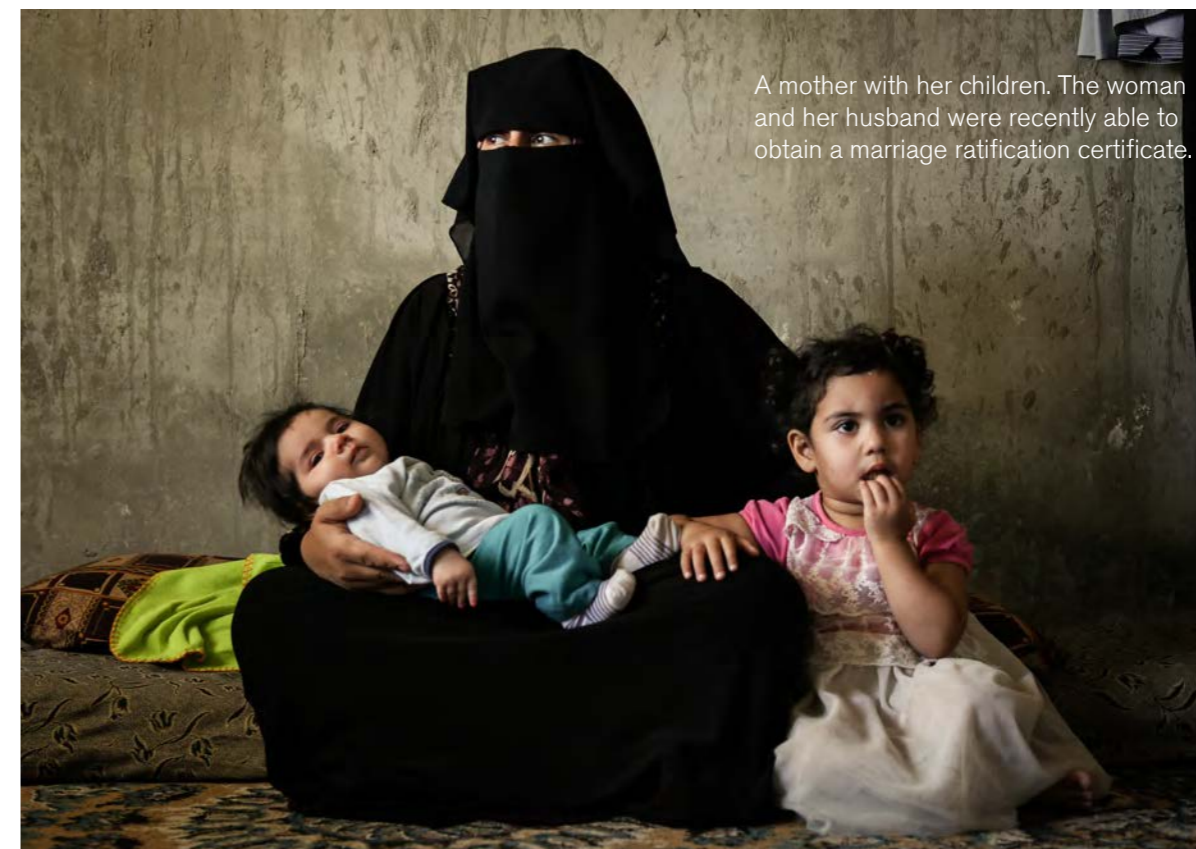
A mother with her children. The woman and her husband were recently able to obtain a marriage ratification certificate.

The Civil Status Department, Shari'a courts, and Magistrates courts each play a role in civil documentation processes in Jordan. The influx of Syrian refugees has meant these institutions have had to cope with an increased workload and larger number of cases in which individuals struggle to meet formal requirements. 97 Requirements that are straightforward for most Jordanians to meet, such as providing proof of marriage to register a birth, often present barriers for Syrian refugees. Important adjust-