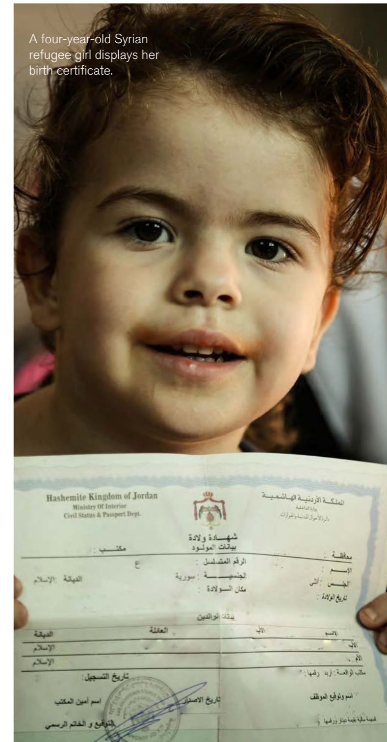
A four-year-old Syrian refugee girl displays her birth certificate.

While in most cases family books or marriage certificates were required as proof of marriage, in five cases the Civil Status Department accepted