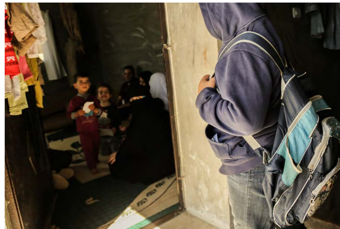
A Syrian refugee family in their house in Irbid. The mother and father have struggled to register their marriage and children's births in Jordan.

In addition to MoI registration, Syrian refugees