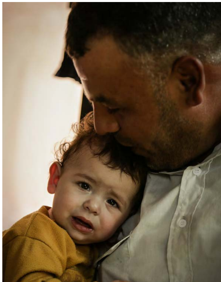
A 36-year-old father worries about his son’s future, as he does not have a birth certificate.

Other families have sought documentation from Syria. In one case reported to NRC staff, a couple left their original marriage certificate in Syria; the husband returned to Syria in order to retrieve the marriage certificate, but was refused reentry to Jordan by Jordanian officials. His wife has since given birth to a child, but has been unable to register the birth because she lacks proof of marriage. In other cases, relatives or friends in Syria have helped families obtain necessary documents at substantial risk. In at least one case, a family used contacts in Syria to obtain a Syrian marriage certificate for a marriage conducted in Jordan. One family left a child’s birth notification in Syria and told researchers that the child’s grandfather, who remains in Syria, planned to go to the local Civil Status Department office to try to have the child stamped into the family book, but ongoing bombing had prevented him from doing so.