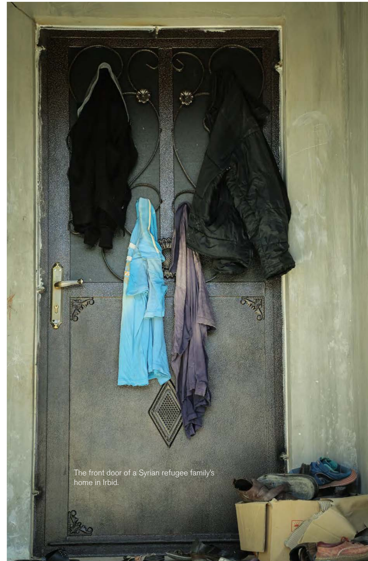
The front door of a Syrian refugee family's home in Irbid.

In July 2015, NRC staff reviewed their database of cases and identified families with whom they had discussed civil documentation matters, but who had not been interviewed in March. Examples from these case summaries were incorporated into this report where they illustrated challenges or consequences not otherwise identified through interviews. 7