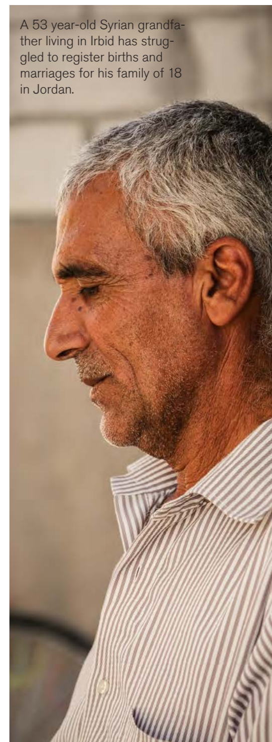
A 53 year-old Syrian grandfather living in Irbid has struggled to register births and marriages for his family of 18 in Jordan.

A variety of other rights are at risk when children remain unregistered. One of the most significant is the right to a nationality. Under Syrian and Jordanian law, nationality is passed through the father; if a Syrian woman gives birth in Jordan but the couple cannot prove that they are lawfully married and so cannot obtain a birth certificate, the child may, in effect, become stateless. 91 The same is true for children born in Syria whose births were not registered there. Refugees interviewed for this report expressed concern about this issue. One mother whose daughter lacked a birth certificate described her as "like a stateless person." A man wanted a birth certificate for his granddaughter because "she needs to be identified as Syrian."