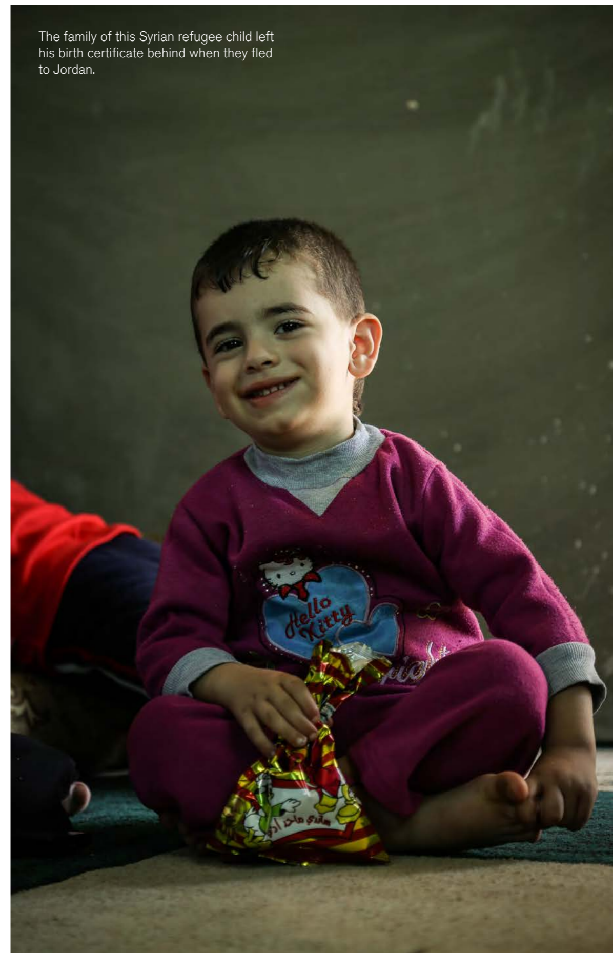
The family of this Syrian refugee child left his birth certificate behind when they fled to Jordan.